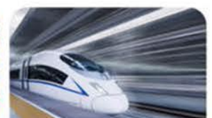
Railway and transportation