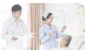
Medical and healthcare